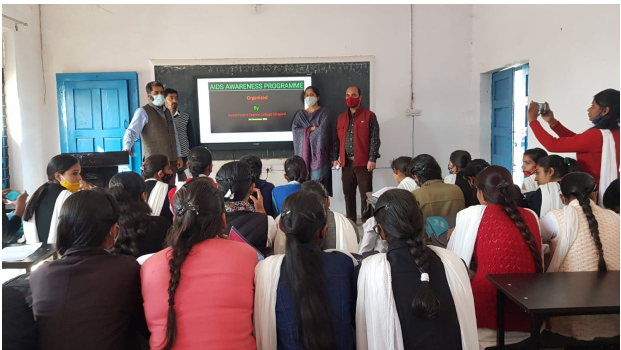
HIV Awareness Programme