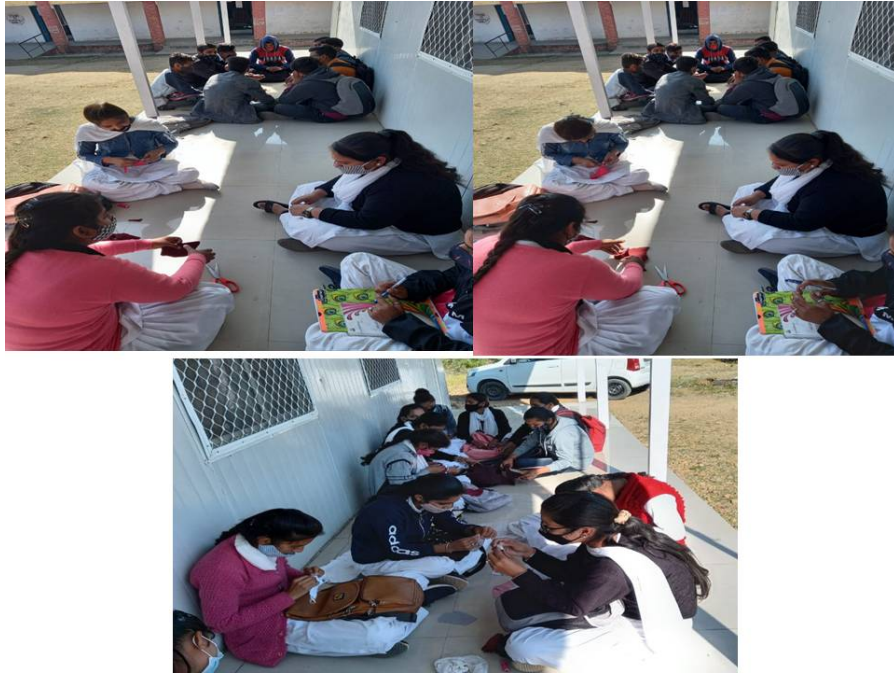
MASK Making Competition